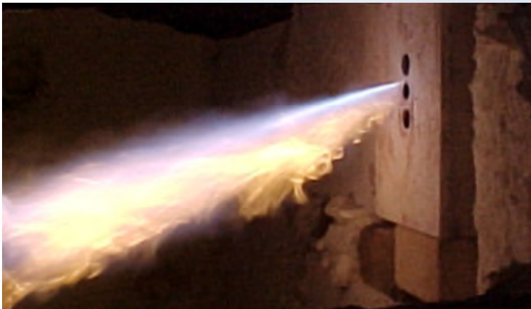
QVW003G000 at 2 MMBtu/hr Low Momentum Setting Adjustment for Angled-Flame Downward