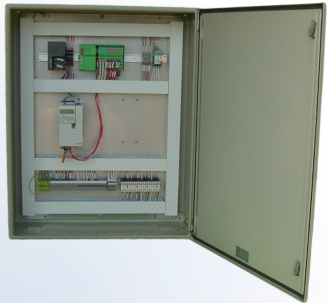
REMOTE 5 HP DRIVE ENCLOSURE WITH LOCAL I/O