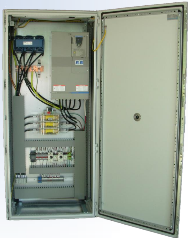
40 kW DRIVE W/LOAD SIDE FILTER & COOLING MOTOR OVERLOADS, CE MARKET