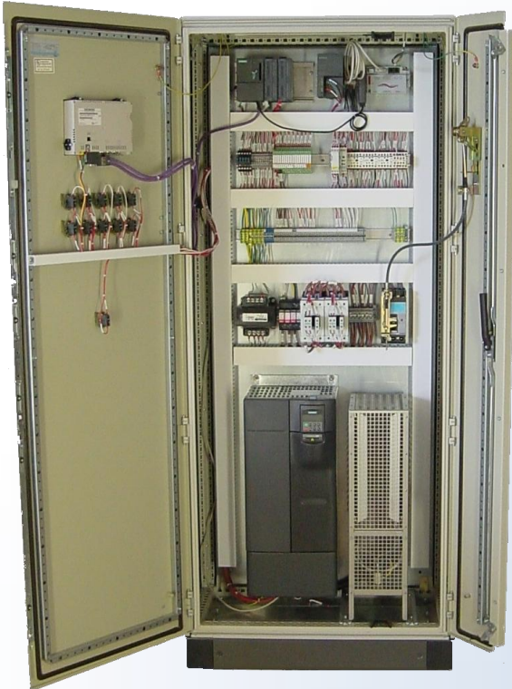
50 HP DRIVE W/DYNAMIC BRAKE, HMI&PLC WITH LOCAL I/O

Xothermic, Inc. supplies motor control packages for a variety of applications. Built for US and EU markets, each system is custom designed and fabricated for the specific customer application.